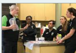
FREE OPERATOR TRAINING

Bring the proven reliability of EO sterilization into your facility with the Anprolene System.