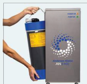
ABATOR WITH CARTRIDGE

Make Your System Zero Emissions: Andersen abators are a simple, cartridge-based system that employ a dry catalyst resin. The resin converts ethylene oxide to biodegradable organic compounds. Replaceable abator cartridge has a 200 cycle capacity. Spent cartridges are non-hazardous.