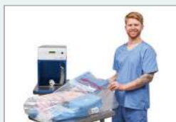
35 LITER LINER BAG