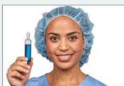
17.6 GRAM AMPOULE