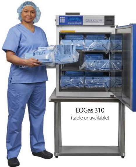
EOGas 310 (table unavailable)